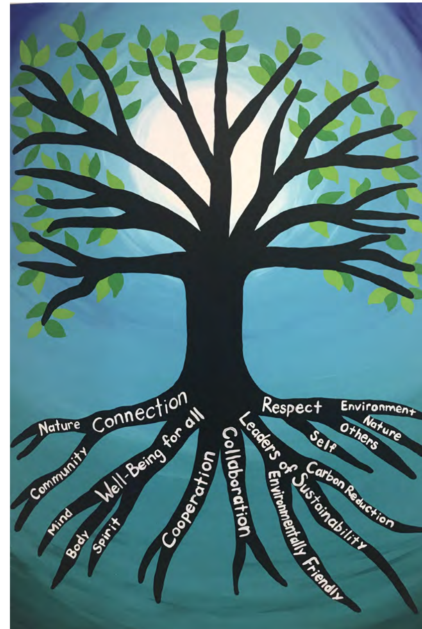
MURAL OF LIVING SCHOOL ATTRIBUTES LOCATED AT COOKSHIRE SCHOOL , QUEBEC, CANADA

Living Schools are places where people are flourishing, where staff and students are on a co-learning journey, and there is an explicit awareness that schools are interconnected with local and global communities, including the natural world. Living Schools reflect an ethos of bringing life to education and education to life. This means that the values of sustainability and well-being for all (Hopkins, 2013; O’Brien, 2016) influence what is learned, how it is learned, where and when it is learned, and ultimately why it is learned. Living Schools demonstrate the inspiring and dynamic transformation that is possible when the very purpose of education is questioned and the answer is that it ought to lead to well-being for all , sustainably. Inspired by Dawson College’s Living Campus, Cape Breton University professors, Catherine O’Brien and Patrick Howard developed the concept of Living Schools (O’Brien & Howard, 2016) and created the Living Schools Attributes Chart as well as a resource for educators (see the Living Schools Discussion Chart in the Appendix) to explore how their classroom and school already reflect the Living Schools Attributes and further steps that they would like to take.